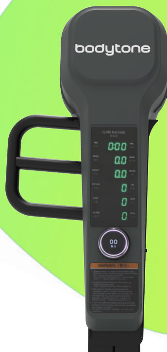
Z CLIMB climber machine